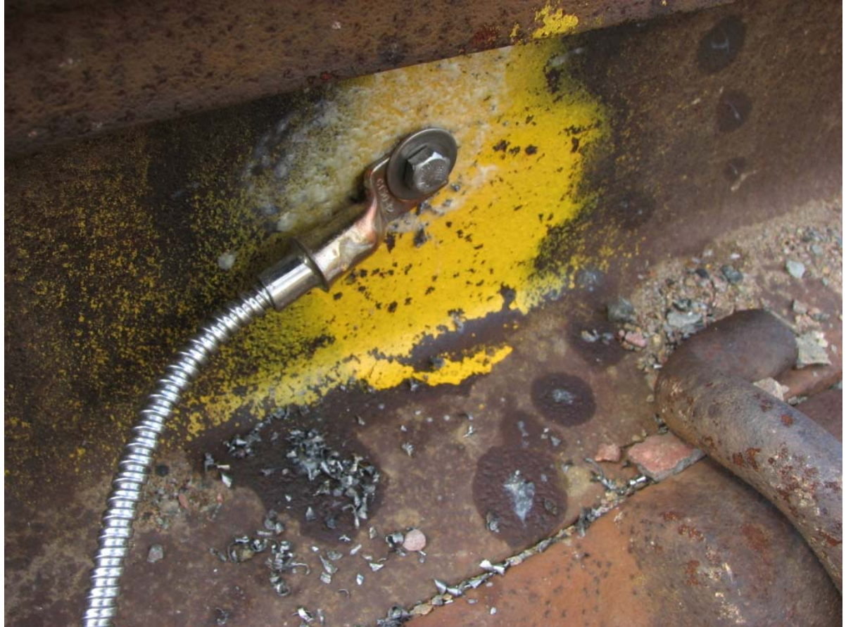
Figure 2 - Temperature Lugs