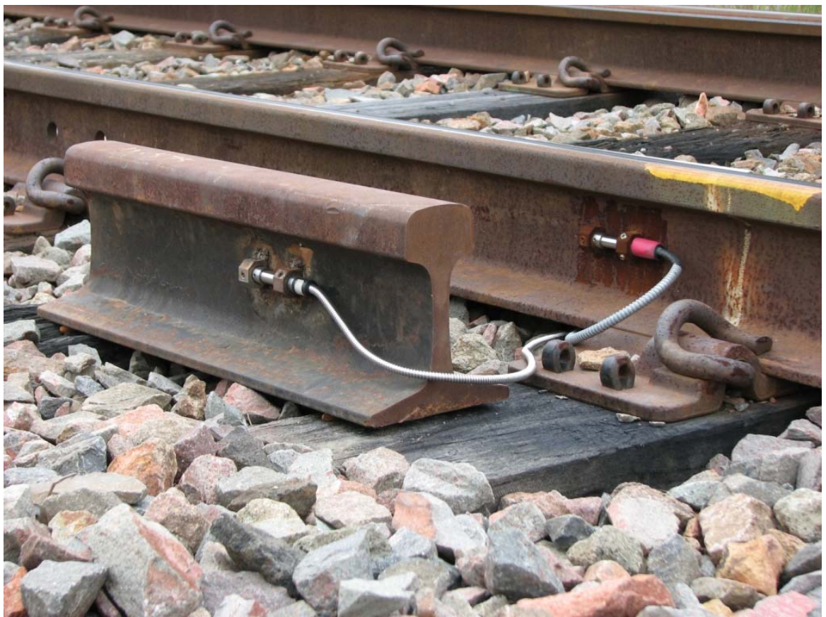
Figure 1 - Stress Sensors

Sensors are installed every 50m along each rail, with the sensors on adjacent rails staggered by 25m.