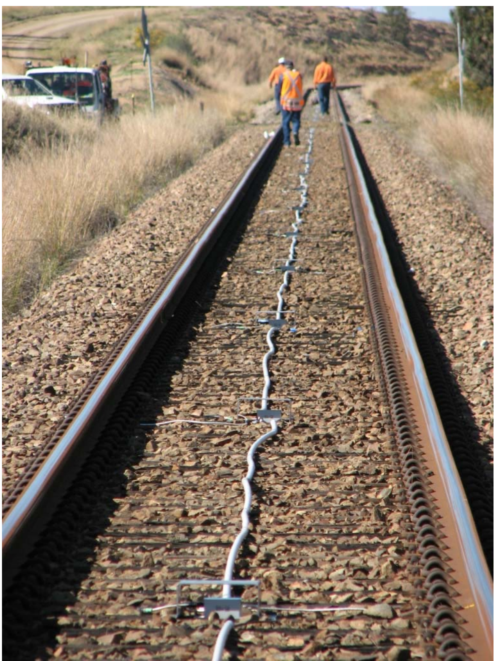
Figure 3 - Sensor installation along railway

The sensor nodes are connected up in a single 'bus' comprising of many 13m segments. Each sensor node is uniquely addressable by the monitoring computer. Figure 3 illustrates the typical arrangement of sensor node, bus and sensors along the railway.